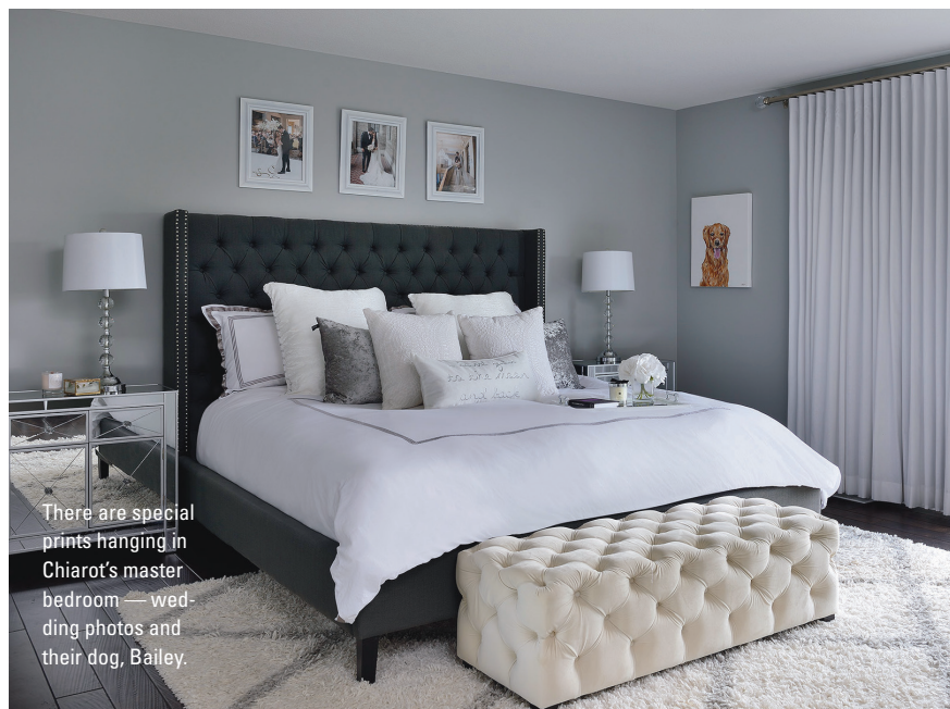
There are special prints hanging in Chiarot's master bedroom — wedding photos and their dog, Bailey.